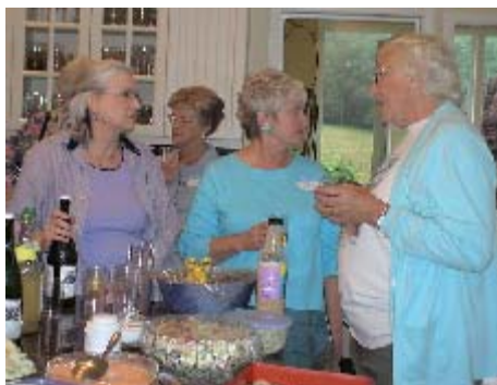
Conversation, camaraderie, and caring.