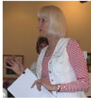
An animated Missy goes with the Flow (Chart).