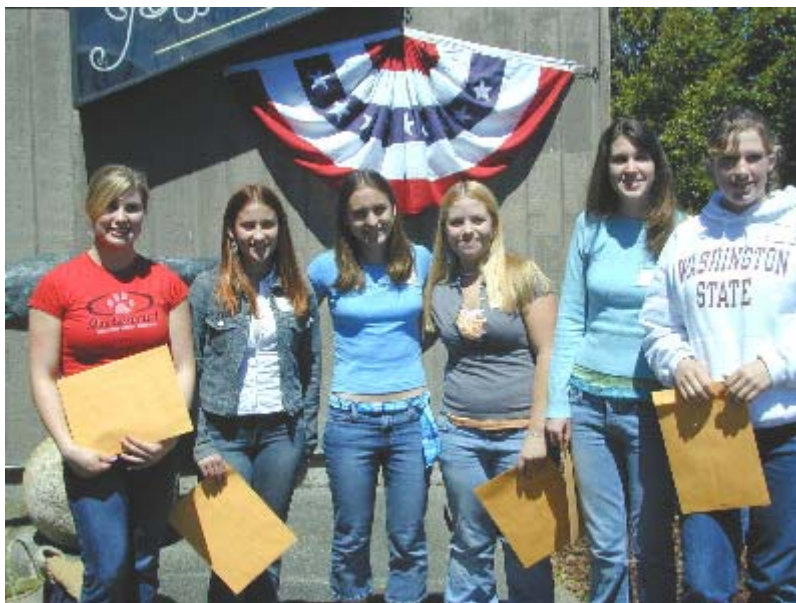
Some of the WINners