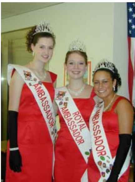
More Visiting Royalty

The 110 th Irrigation Festival is history. And Soroptimist of Sequim was once again part of the festivities. On Saturday, May 14, 2005, we hosted the VIP Luncheon, with help from our partners at Key Bank. Our local royalty as well as royalty and supporting crew from around the state stopped by to change their clothes, fix their hair, have a bite to eat, and generally join in the fun. Many thanks to all the Soroptimist members who helped make it happen. Some of the helpers are pictured below.