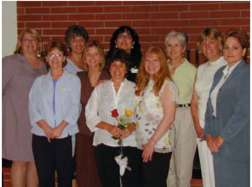
Do you recognize these women? They are our 2005 - 2006 Officers and Board.